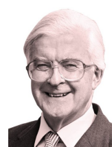
Rt. Hon. Lord Kenneth Baker