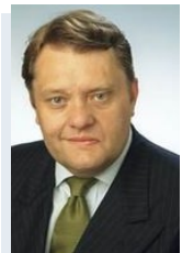
John Hayes MP