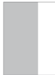
2/3 page, vertical 297 mm x 140 mm