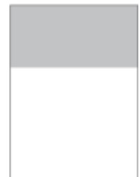
1/3 page, horizontal 70 x 210 mm