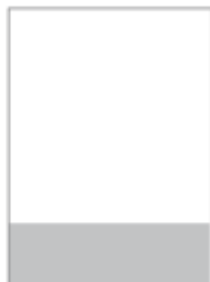
1/4 page, horizontal 74 x 210 mm