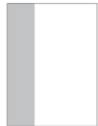
1/3 page, vertical 297 x 70 mm