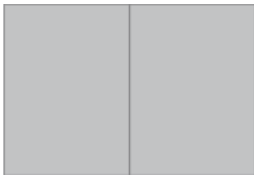
2/1 page 297 x 420 mm