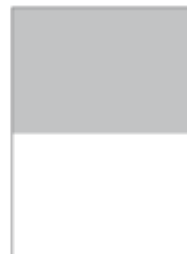
1/2 page, horizontal 148,5 x 210 mm